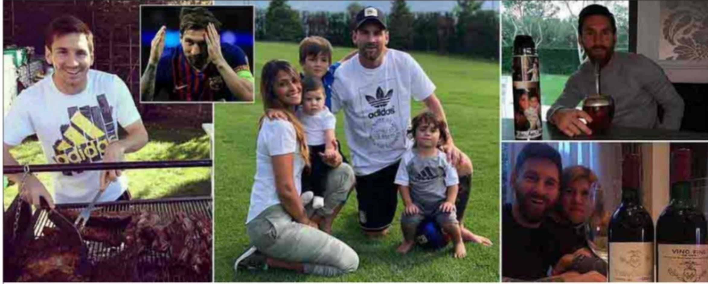
After recently averaging 40 goals for 10 consecutive calendar years, Lionel Messi showed no signs of letting up at the age of 31. However, while he proved to be a special talent in the earlier stages of his career, there were questions on whether the Argentine prodigy could maintain his brilliance as the years went on.

With Japan on the rise with both their senior and junior teams making good progress in the lead-up to the Tokyo Olympics, the India colts had their task cut out. Their attack was often challenged with good, disciplined defence structure that Japan adopted during the entire duration of play.